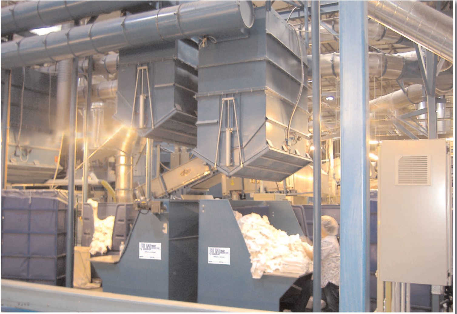
FLM AUTO LIFT TABLES UNDER A FLM PNEUMATIC CONVEYING SYSTEM.